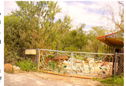
Wild at heart

Revitalize this amazing community space—a vital, thriving locus of gathering and community, an urban retreat and place of solitude. Help us to keep it safe, beautiful, welcoming, meaningful, and an expression of our own diverse local culture.