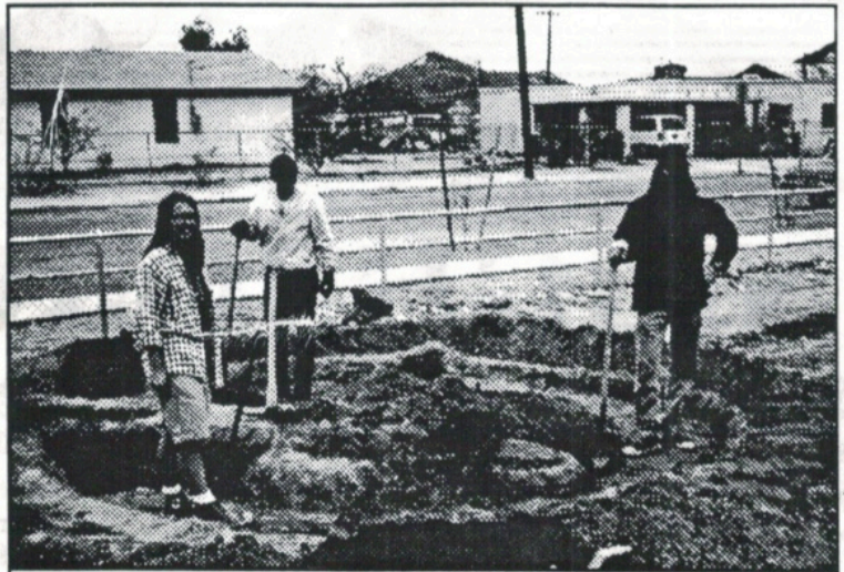
Neighborhood residents work to put in the new Community Garden at the corner of 11th Ave. and University Boulevard. (see page 3)