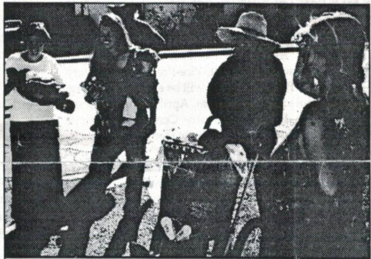
Neighborhood mothers gathered recently after visiting the Community Garden. A neighborhood parenting group meets on the fourth Sunday of every month at Estevan Park. For those interested, call Sabine Wilms at 624-0759.